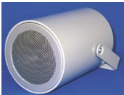
RL-1 / RL-2