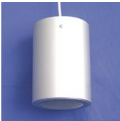
RL-5 / RL-6