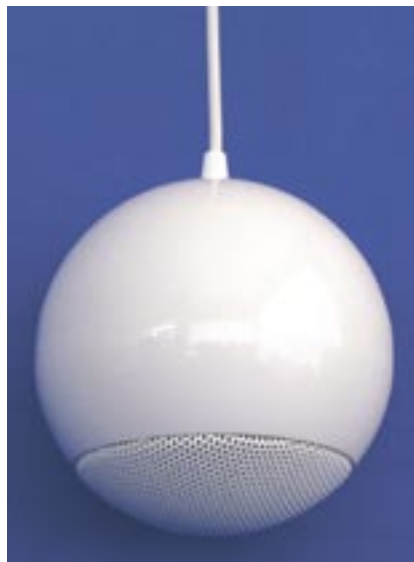
KL-180-CX10 / CX15

The ventilated housing of WDW-330-CX is used as a bass-reflex system. It impresses by extraordinary music reproduction thanks to two-way technology. The symmetrical design permits horizontal and vertical installation options. Delivery includes screws and wall plugs. Anti-theft protection is ensured by suitable mounting components. Volume controller can be integrated as an option.